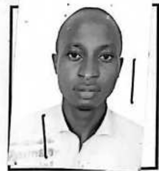
G. S. G's Office Minna 066-222532, 220646, Fax: +(234)-66-222206